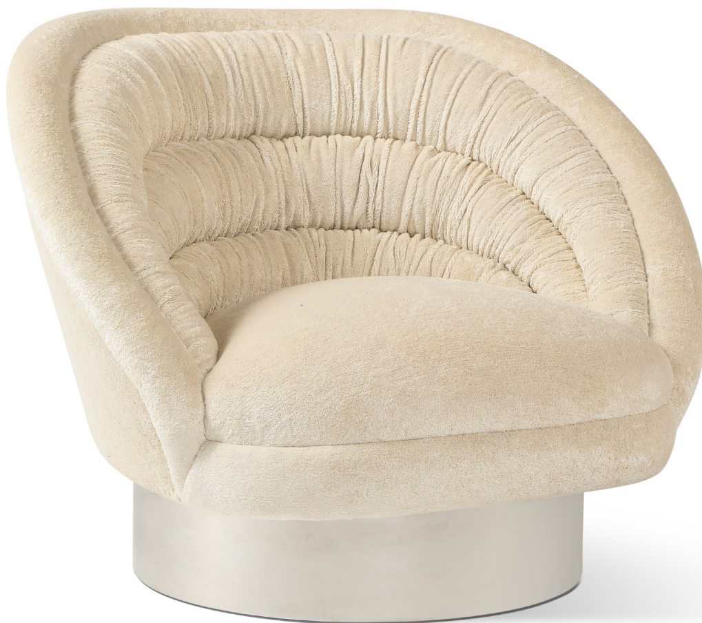
Ellipse Lounge Chair Model - 1976 | Designed 1976